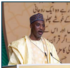
Muntaka Mohammed Mubarak Minister of Interior, Ghana