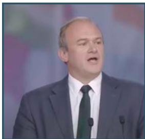
Sir Ed Davey MP Leader of the Liberal Democrat Party