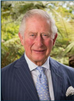
His Majesty, King Charles III

Please convey my warmest thanks to the Members of the Ahmadiyya Muslim Community in the United Kingdom for their loyal greetings, sent on the occasion of their Annual Convention (Jalsa Salana) which is being held this weekend at Hadeeqatul Mahdi, Oaklands Farm.