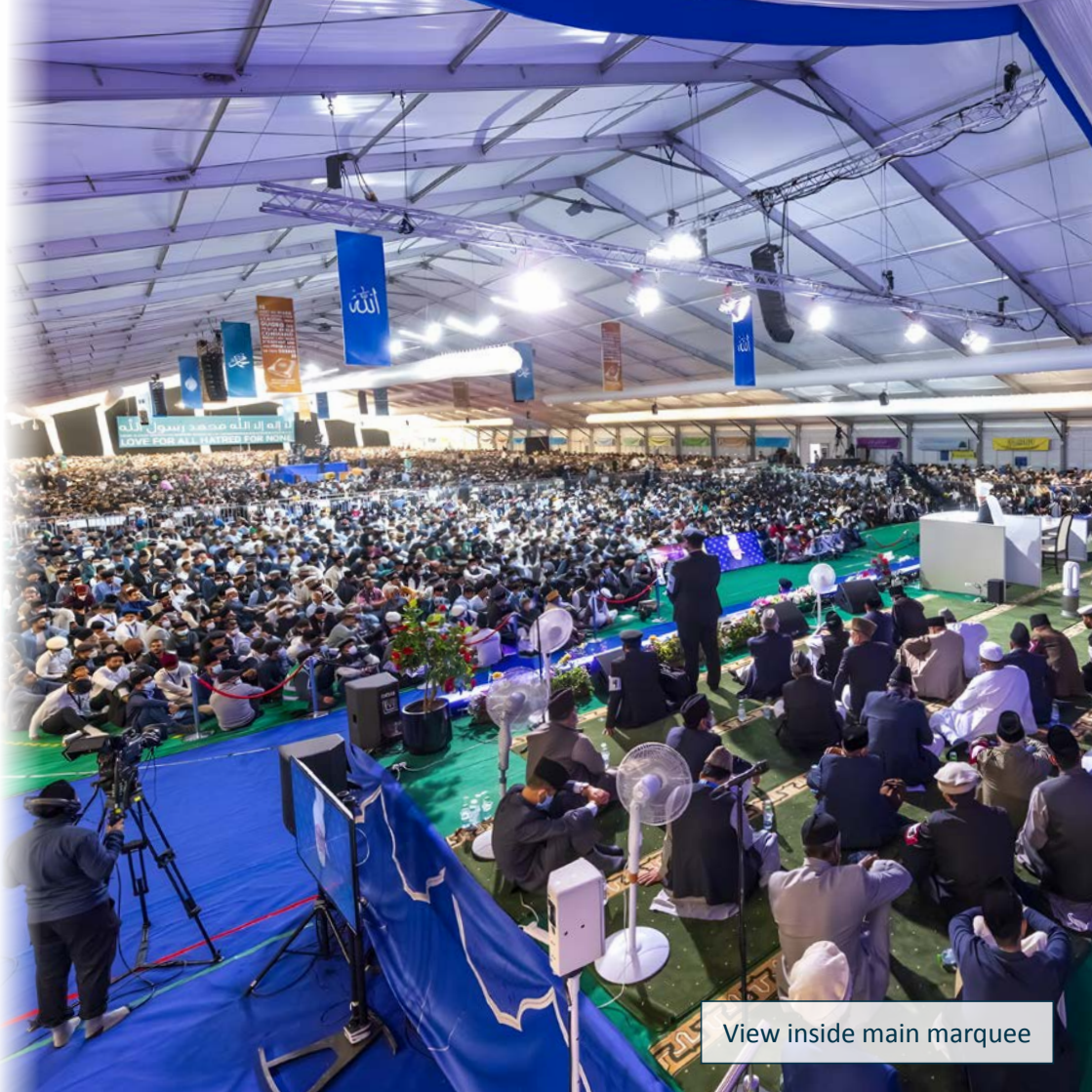
View inside main marquee