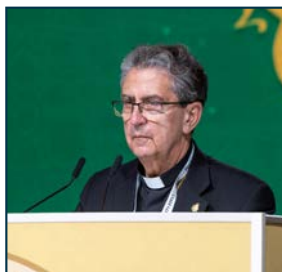
H.E Archbishop Miguel Maury Buendía Apostolic Nuncio to Great Britain